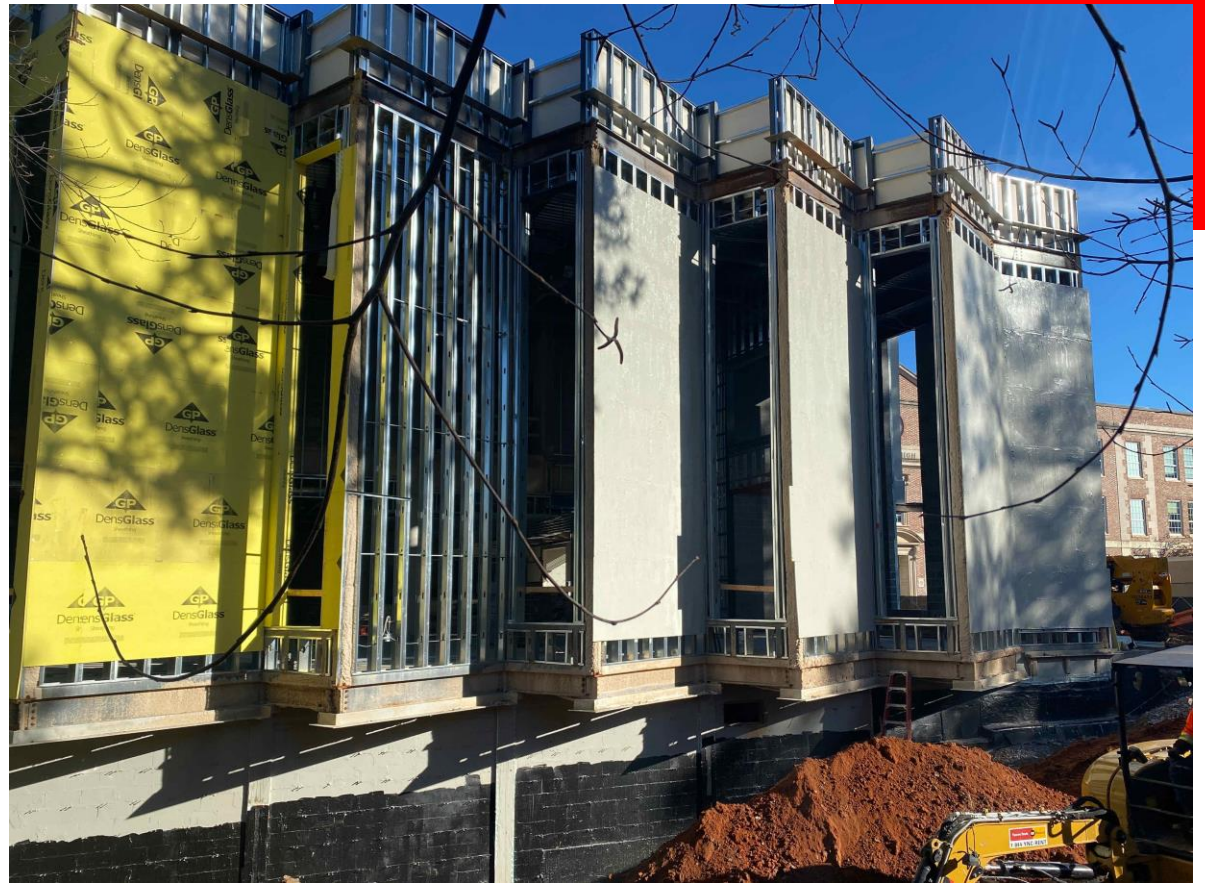
Exterior Sheathing and Waterproofing Progress West Wall of New Addition